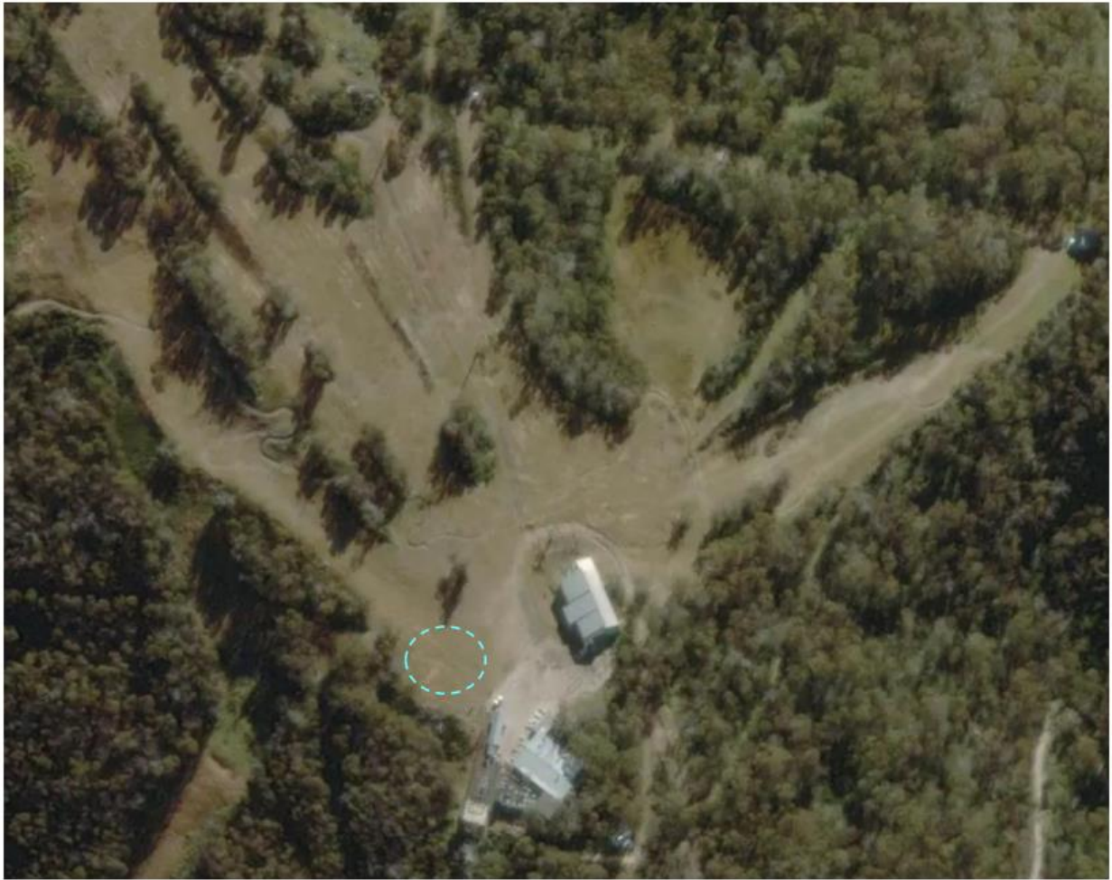
Figure 6 | Proposed Temporary Stockpile Location at Merritts Base Area (Source: Applicant's documentation).

The NPWS has recommended that all machinery and equipment must be stored on existing disturbed areas (i.e. stockpile and staging areas on ski slopes) and should not be stored on native vegetation.