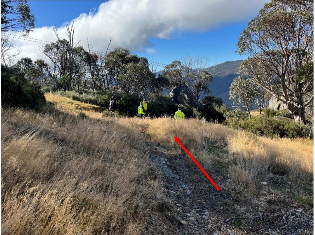
Figure 2 | Proposed Trail to follow predominately disturbed area, into native vegetation island (facing east)