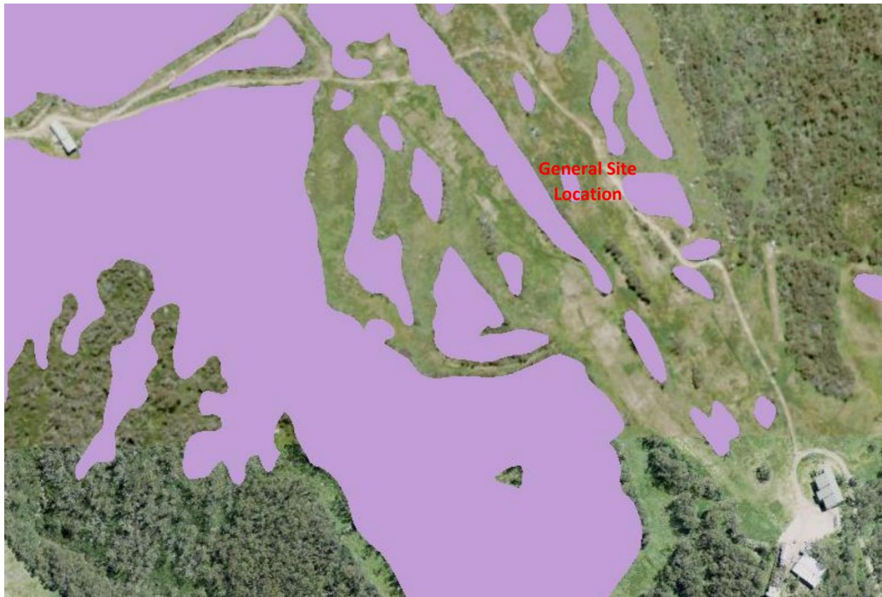
Figure 3 | The site in relation to areas identified on the Biodiversity Values Map

on the Biodiversity Values Map as being of high biodiversity ( Figure 3 ). The Applicant has provided a BDAR to meet the requirements of the Biodiversity Assessment Method 2016.