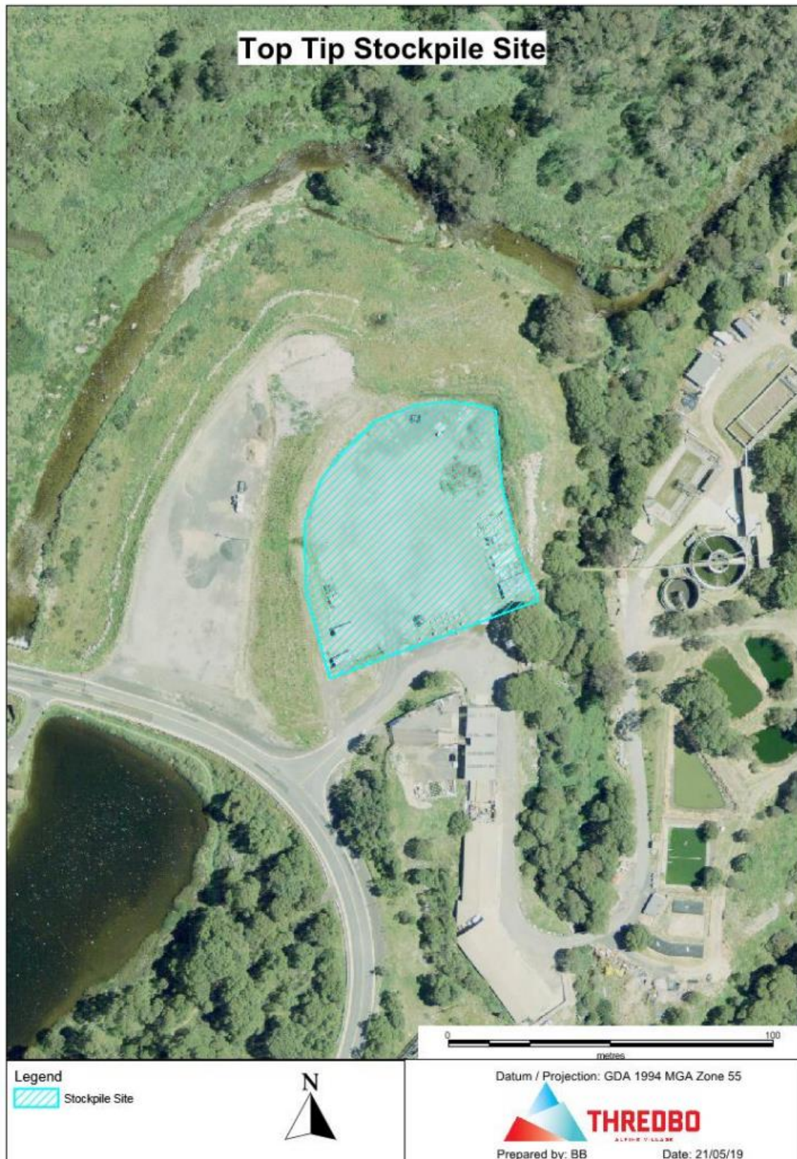
Figure 5 | Main stockpile location within Thredbo's Waste Transfer Station (Source: Applicant's documentation).